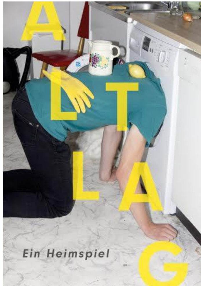
From "ALL TAG - Ein Heimspiel"