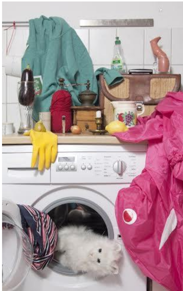
From "ALL TAG - Ein Heimspiel"